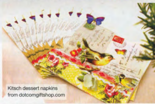
Kitsch dessert napkins from dotcomgiftshop.com