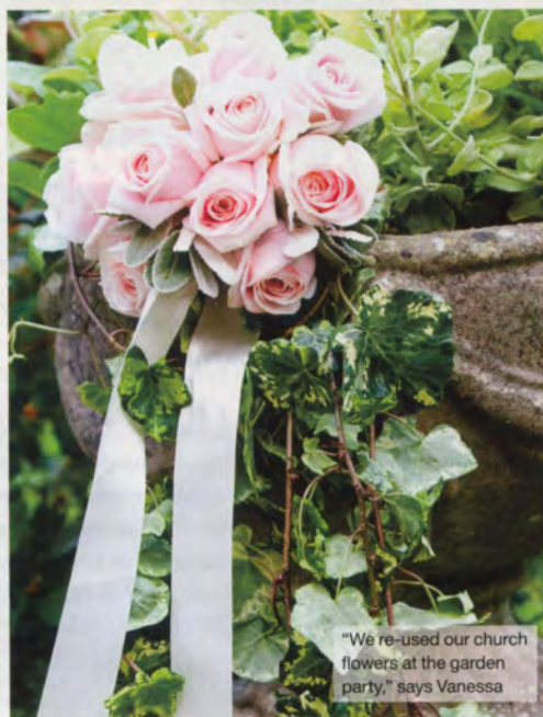
"We re-used our church flowers at the garden party," says Vanessa